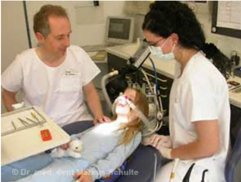
Small patients – large anxiety