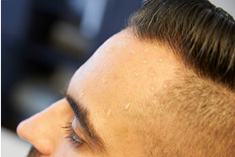
Cold sweat at the dentist

free from anxiety. We know from our wealth of experience with numerous cases that we have handled successfully that this is an achievable goal. By no means do we rely solely on treatment being carried out under general anaesthesia; instead, we consider a variety of interventions and options that have been tried and tested in our clinic over the years.