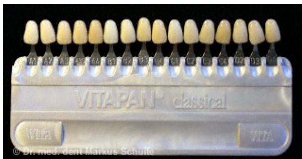
Vitapan shade guide

Detailed scientific information on the effectiveness and safety of ZOOM teeth whitening can be found here (pdf file)