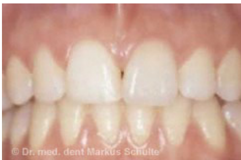
Devitalised right incisor before and after internal bleaching